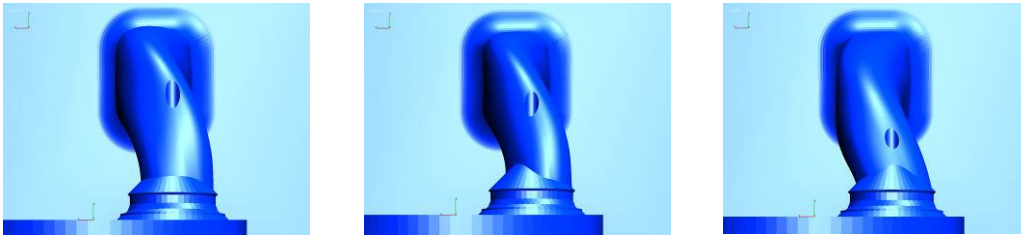
Figure 1. Separation Edge, Side Contour and Low Contour (minimum values).

reason why they can not be shown directly, but in their for example minimum value, keeping fixed the other two parameters in their average value (see Figure 1 ).